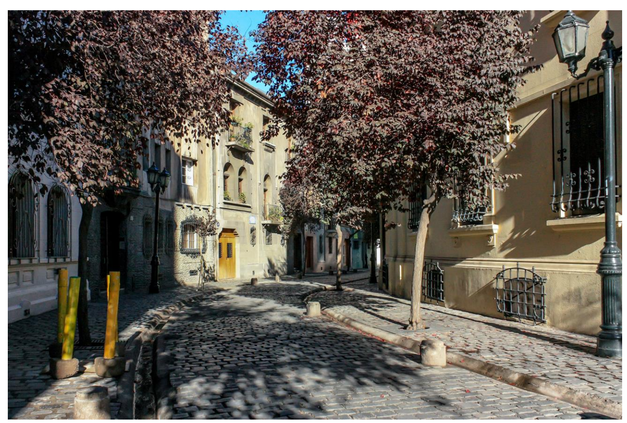
Lastarria neighborhood in Santiago, Chile

The Lastarria Neighborhood has become a cultural space and a true legacy for architecture due to its important constructions. One of them is the Veracruz Parish, declared Historical Heritage in 1983. It was built between 1952 and 1957.