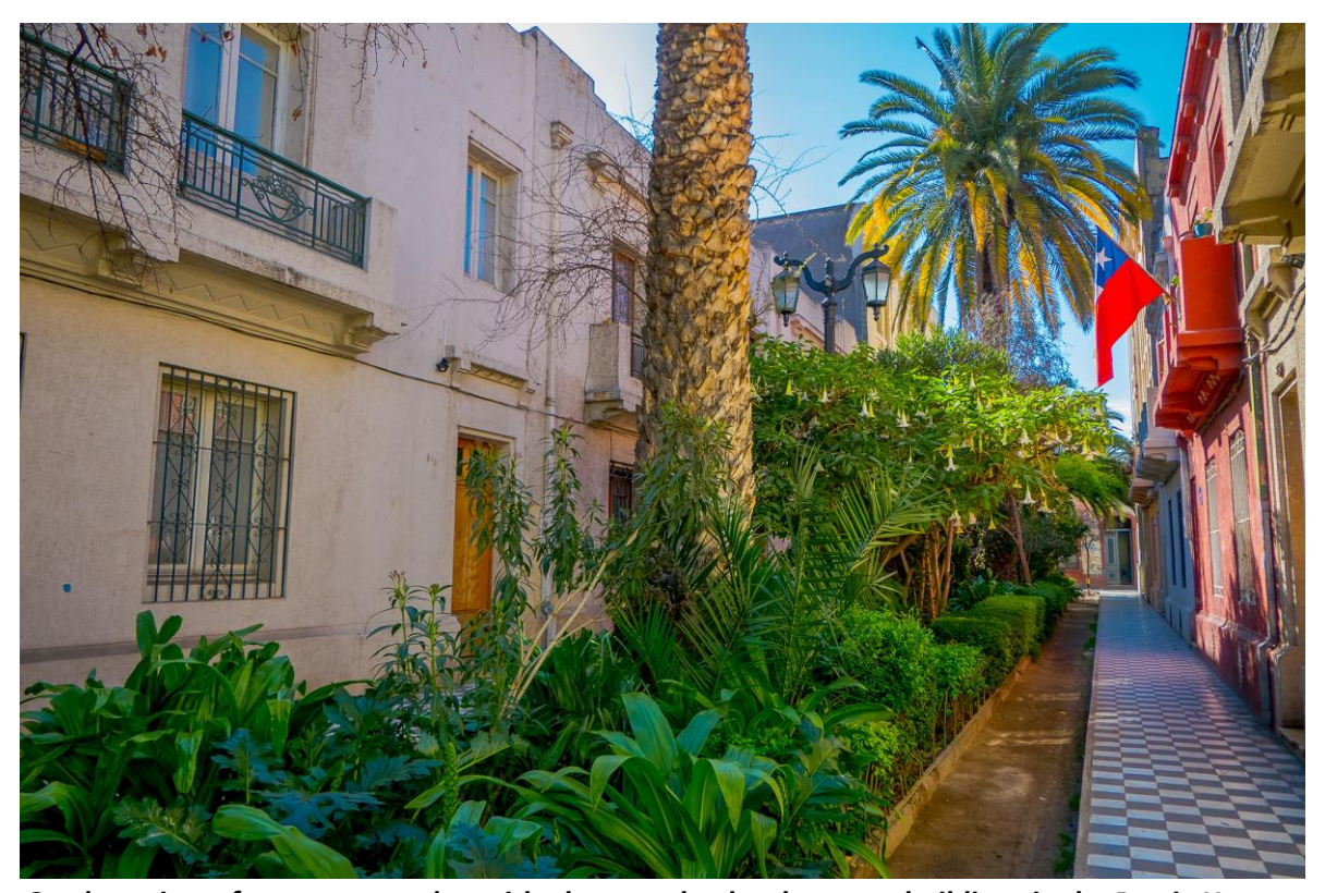
Outdoor view of gorgeous garden with plants and palms between buildings in the Barrio Yungay in Santiago, capital of Chile.

Barrio Yungay: It is a heritage neighborhood with buildings dating from the eighteenth century, considered as a jewel in the history of the country and it is currently an active cultural center.